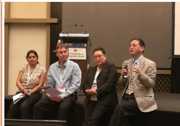
FOP WORKSHOP Q&A SESSION